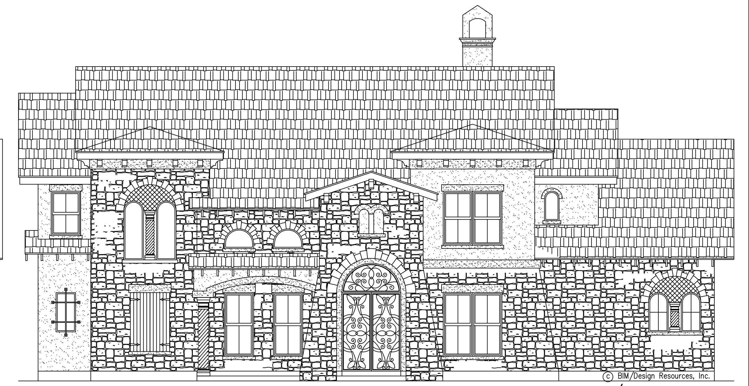
FRONT ELEVATION OPTION W/O CASITA