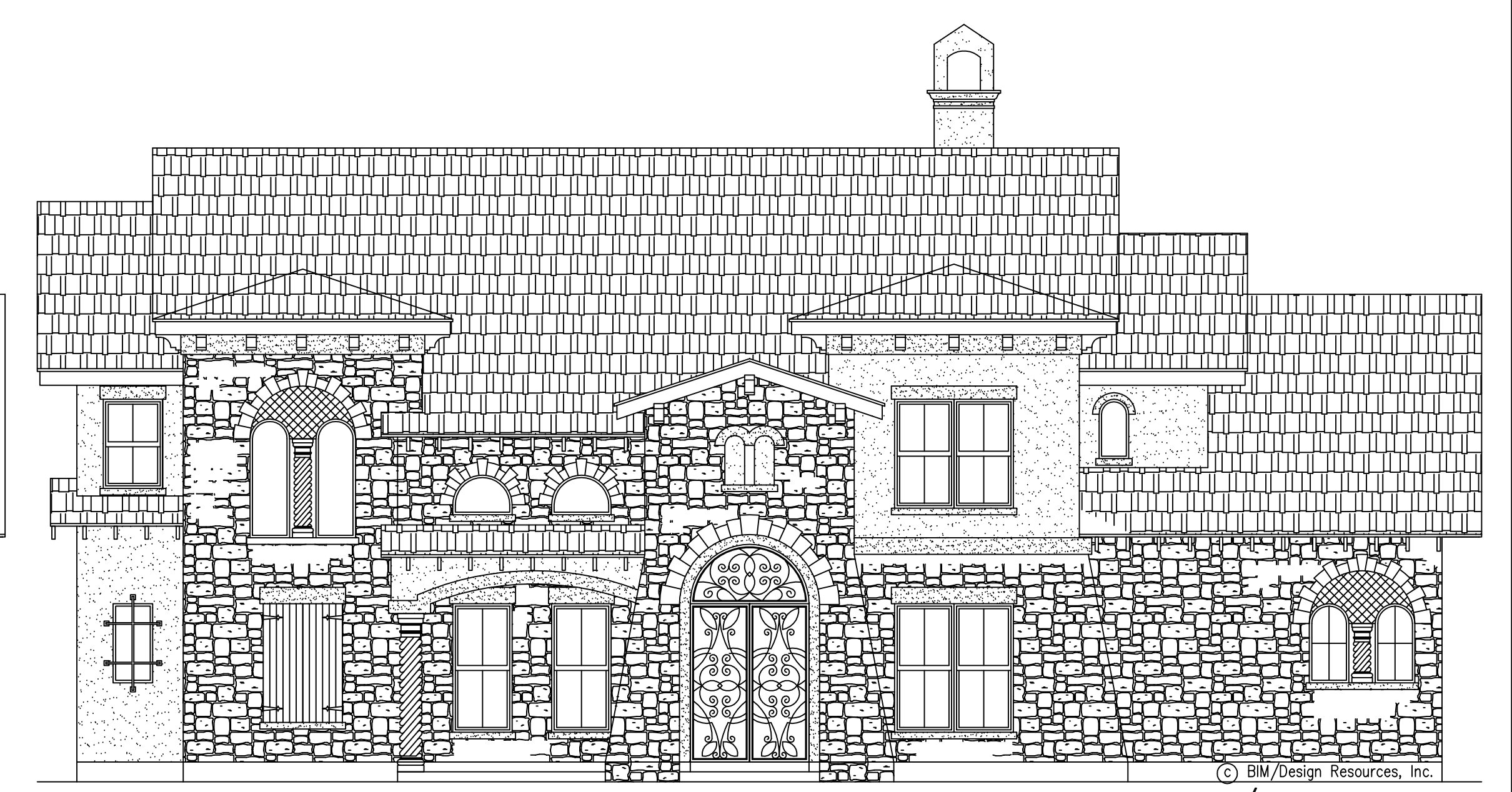
FRONT ELEVATION OPTION W/O CASITA